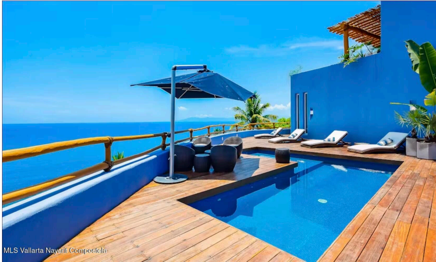
MLS Vallarta Navaril Composeccla

MLS: 34872 4 Beds 7 Baths 727.73 m 2 / 7,833.28 sqft