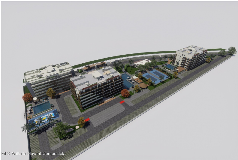
MLS Vallarta Nayarit Compostela

MLS: 34699 1 Beds 1 Baths 76.70 m 2 / 825.61 sqft