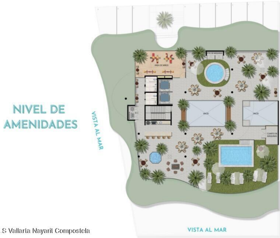
MI S Vallarta Nayarit Compostela

MLS: 34458 4 Beds 5 Baths 233.31 m 2 / 2,511.38 sqft