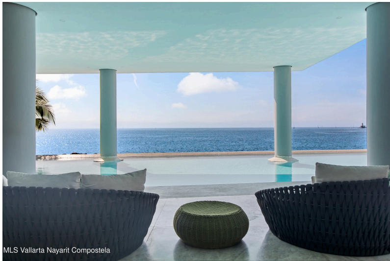
MLS Vallarta Nayarit Compostela

MLS: 29452 2 Beds 2 Baths 69.48 m 2 / 747.92 sqft